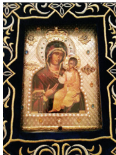
Holy Myrrh- Streaming Hawaii-Iveron Icon

This brings us to the most interesting aspect of the icon that visited us: it is actively “myrrh-streaming.” Over the course of the church’s history, the relics of various saints have been known to exude myrrh, which is a fine and fragrant oil. The most famous of these is probably St. Demetrius of Thessaloniki. His relics