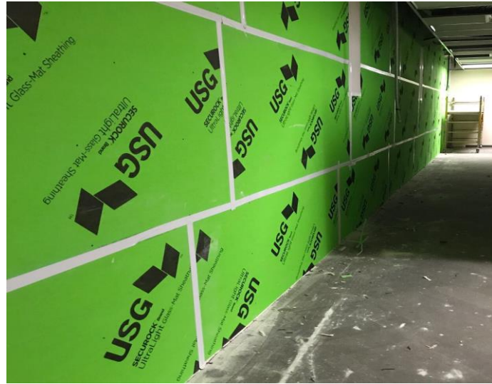
Picture 5: Construction view of the Existing Building Temporary Wall.