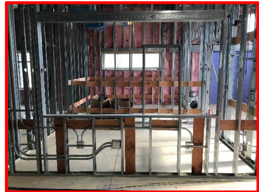
Picture 6: In-Wall Electrical Rough-In and In-Wall Blocking in the Early Childhood Education Observation Room