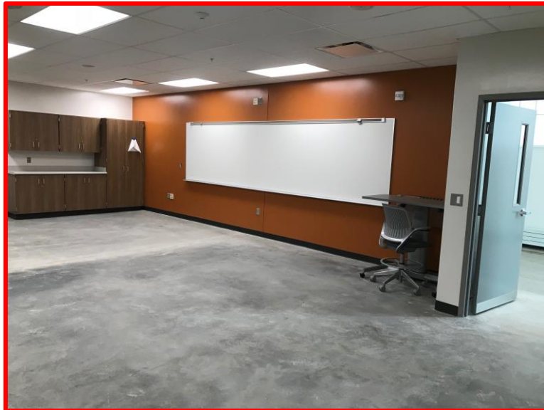
Picture 7: Shared Classroom between Engineering Tech and Auto Tech High Bay Labs