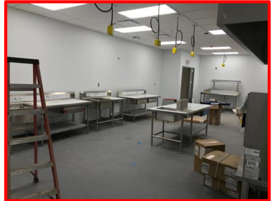
Picture 1: Kitchen Equipment in the Professional Food Service Kitchen