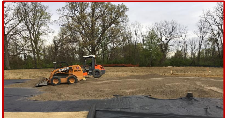
Picture 5: Placement of geotextile fabric under gravel at the North Access Drive Parking Lot