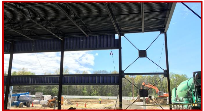
Picture 1: Sheathing along the West side of Area D in Student Dining

https://elford.sharefile.com/d-se2b4834f91547e1b