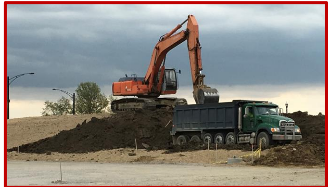
Picture 2: Topsoil relocation from the edge of the South Parking Lot