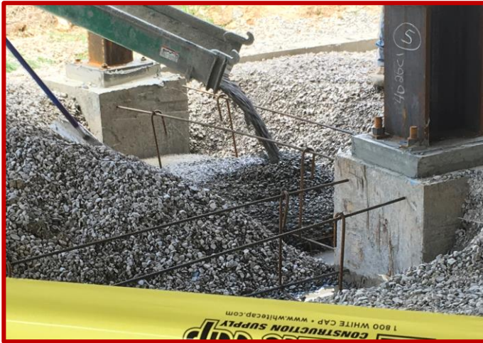
Picture 4: Placement of concrete footing at the temporary wall at column line 21 in Area D