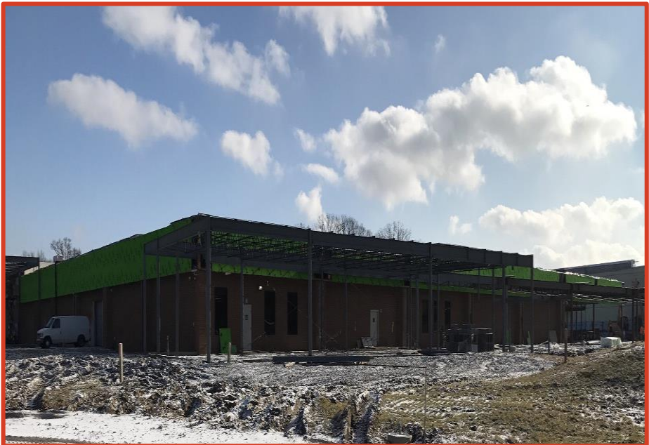
Picture 4: Erection of Structural Steel for Early Childhood Development