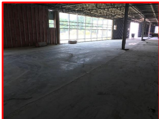
Picture 3: Slab on Grade in Corridor from Admin Area to Early Childhood Development