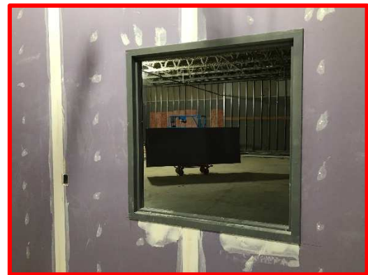
Picture 5: View from Consultation Room into the Exercise Science Lab