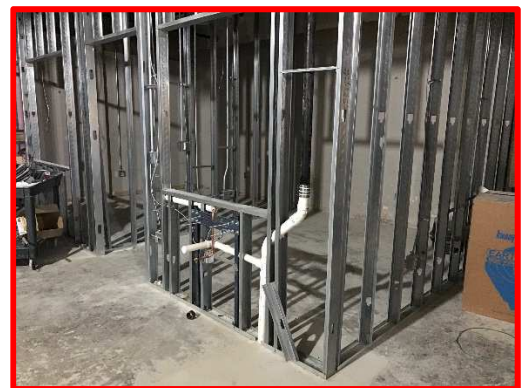
Picture 6: In-Wall Plumbing Rough-In for Water Fountain in Fire Service Tech