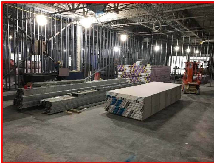
Picture 4: Staging of Material for Drywall Installation in Area G classrooms