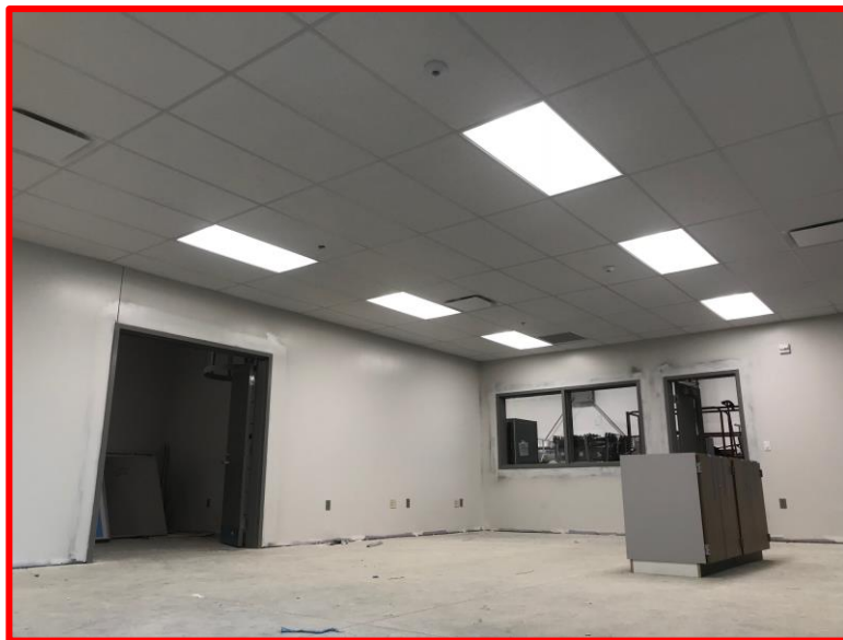
Picture 5: Ceiling Tile in Shared Classroom between Power Lines and Construction Tech Labs