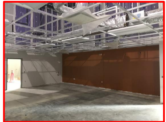
Picture 2: Progress in Shared Classroom between Auto Tech and Engineering Tech