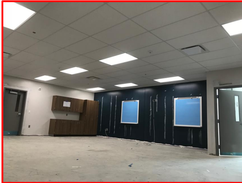
Picture 4: Casework in Shared Classroom between Power Lines and Construction Tech Labs

Delaware Area Career Center: South Campus Consolidation of Facilities