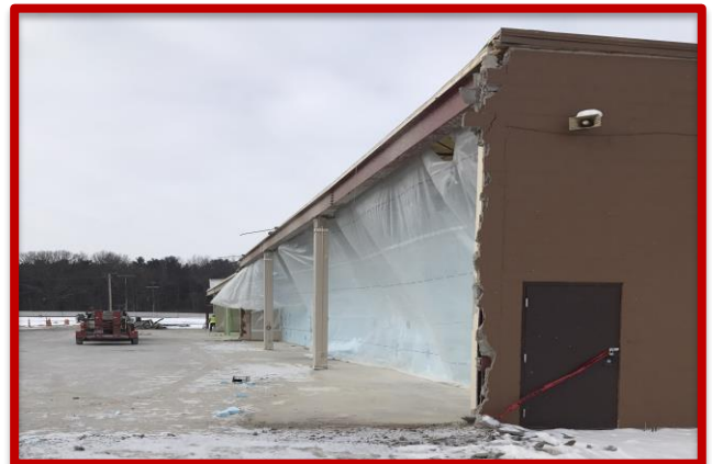
Picture 2: Selective Structural Demolition completed on the Southern Elevation of Existing Building