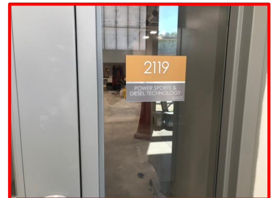
Picture 3: Interior Signage in the Power Sports and Diesel High Bay Lab