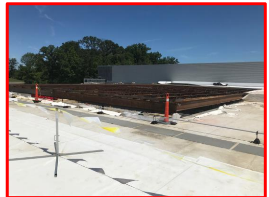
Picture 2: Erection of Structural Steel for the New Portion of the High Roof in Area G