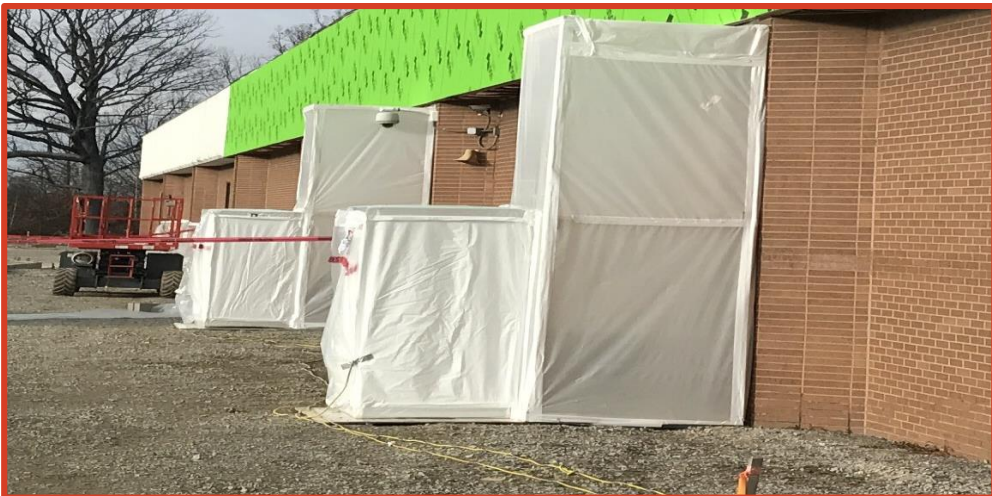
Picture 5: Typical Full Abatement Containment for Transite Column Panels