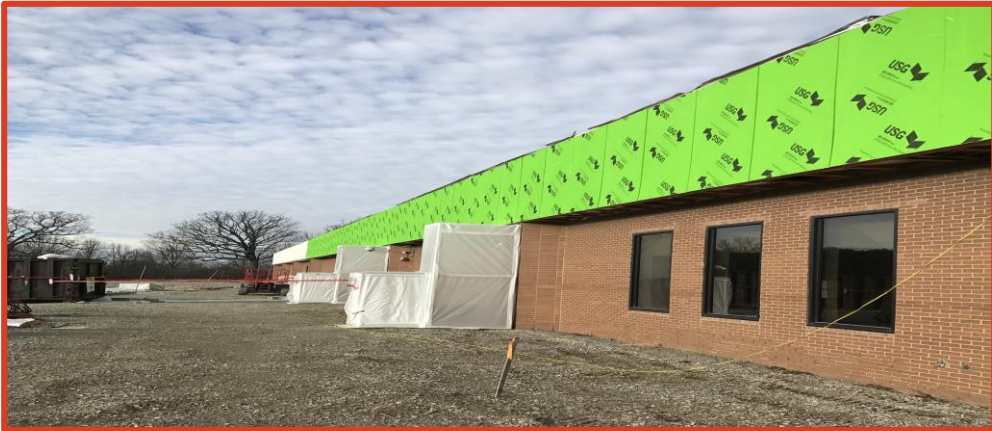
Picture 4: Temporary Enclosure of Transite Panels on the Western Elevation

Delaware Area Career Center: South Campus Consolidation of Facilities