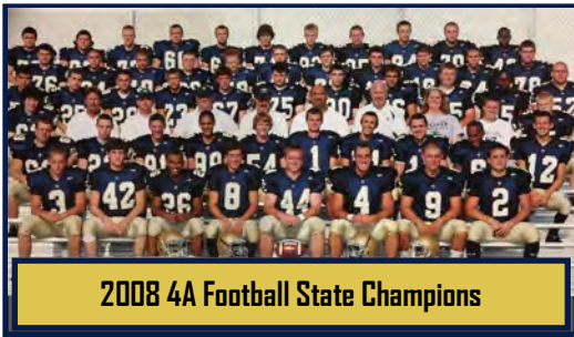
2008 4A Football State Champions