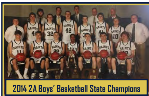
2014 2A Boys' Basketball State Champions