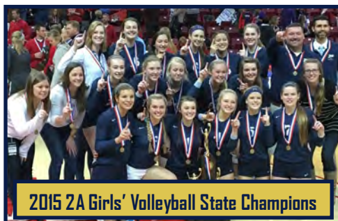
2015 2A Girls' Volleyball State Champions

FOR GENERATIONS SAINTS HAVE HOISTED TROPHIES WHILE LEARNING TO EXCEL IN ALL FACETS OF THEIR LIVES, THANKS TO SO MANY WHO GENEROUSLY SUPPORT SAINTS ATHLETICS. SAINTS FAN CLUB PROVIDES BOTH VOLUNTEER SUPPORT AND FUNDING FOR ALL OUR ATHLETIC PROGRAMS AND EVENTS INCLUDING EQUIPMENT, UNIFORMS, OFFICIALS, FACILITIES, AND MORE. THANK YOU FOR YOUR TREMENDOUS LOYALTY OF OUR VIBRANT SAINTS COMMUNITY AND FOR HELPING PROVIDE IN ALL AREAS OF SUPPORT NECESSARY FOR OUR STUDENT-ATHLETES TO BE SUCCESSFUL.