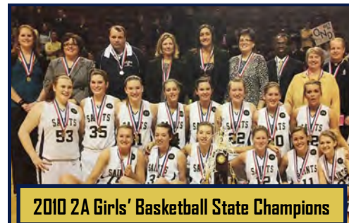
2010 2A Girls' Basketball State Champions