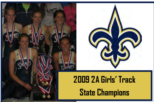
2009 2A Girls' Track State Champions