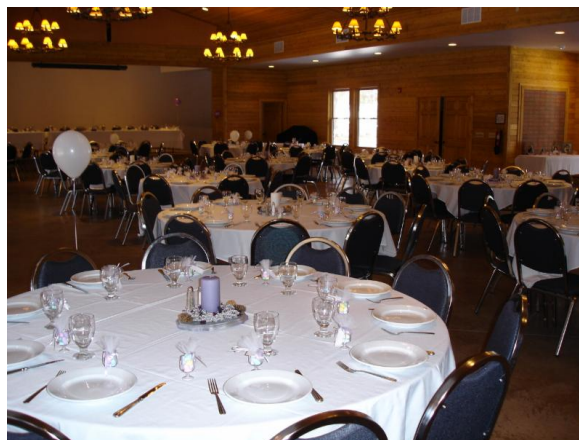
Inglis Hall, with a lovely wedding setup

Indoor options for the wedding ceremony and/or the reception are just as lovely and so unique. The Taylor Memorial Chapel is a southwestern-style gem, designed by famous architect John Gaw Meem, and preserved on the National Register of Historic Places. Also protected on the State and National Register of Historic Places is our stunning Ponderosa Lodge. Ponderosa an outstanding, vintage, rustic style setting that will take guests' breath away. Our Inglis Hall provides the largest space, and a great sound system and nice floor for dancing!