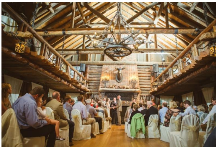
In Ponderosa Lodge, for a breathtaking wedding ceremony

"The Ponderosa Lodge was filled with such love on Saturday . And it was the perfect receptacle for this love - amplifying it, making it safe, embracing it. What a special location, nurtured lovingly by you and your team. We just wanted to take a moment to thank you."