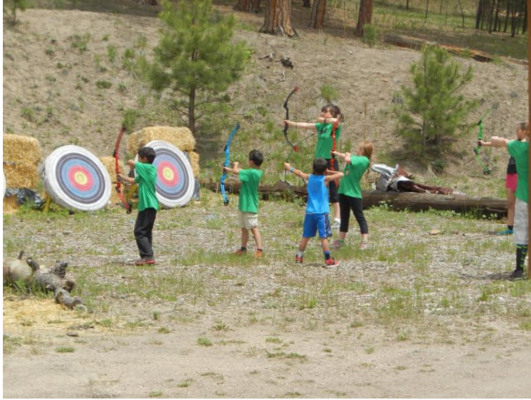
Young campers love trying archery, many for the very first time here at La Foret!