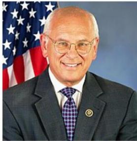
CONGRESSMAN PAUL TONKO