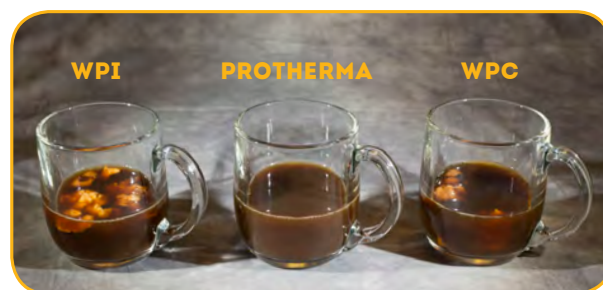
ProTherma Completely Dissolves into Hot Water