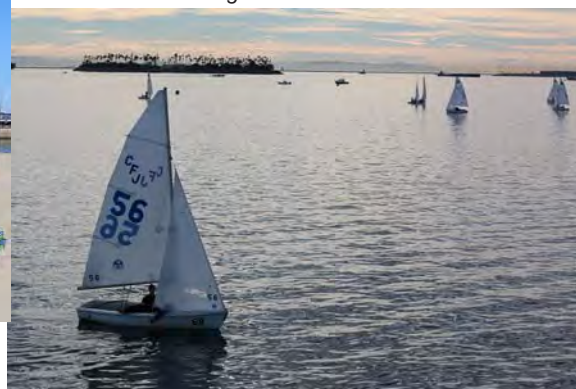
No wind at the Rose Bowl Regatta