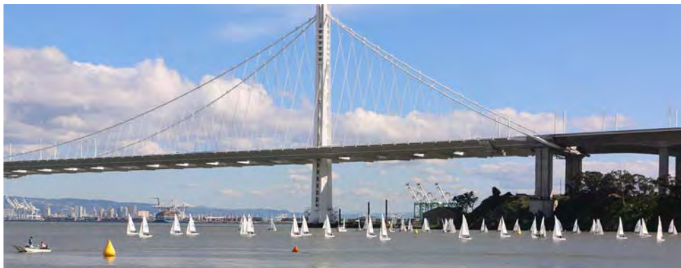
Sailing under the Bay Bridge