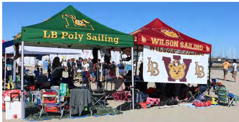
Our tent at Sea Otter Regatta at Monterey