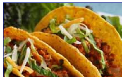
Tacos cart for Friday evening Happy Hour.