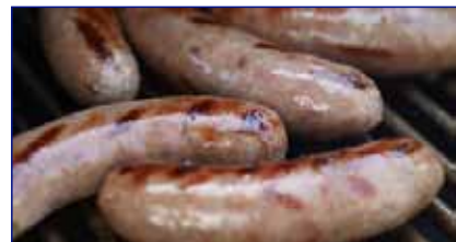
Free brats and beer during raft-up until they run out.