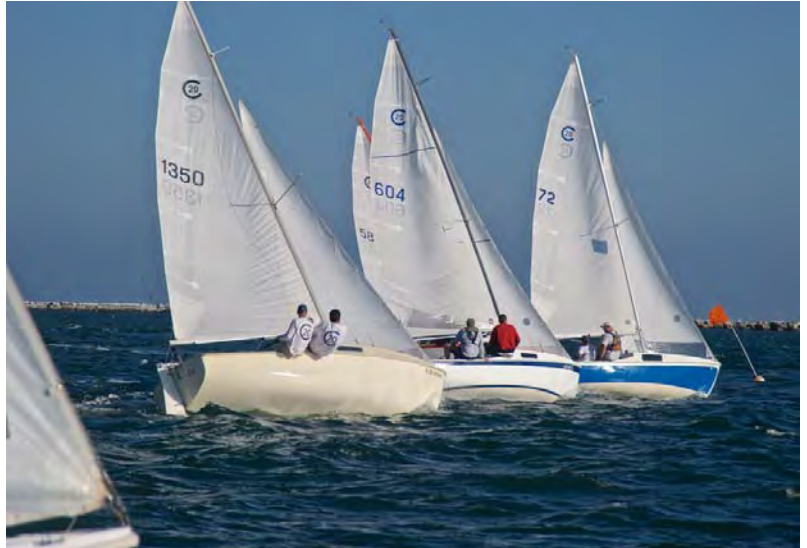
Cal 20 racing action at the Gulch. We are expecting 25 to 30 boats at the CBYC hosted Class Championships this year.