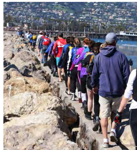
Rotating off the Santa Barbara breakwater