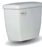
005 Toilet Tank