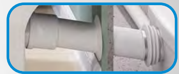
030 Extension Pipe

Choose any fixtures (sink, shower, bathtub) from different brands to complete your dream bathroom. There is no limit to what you can achieve with Saniflo systems. Increase your home value without major cost and have a full functioning bathroom in less than a day.