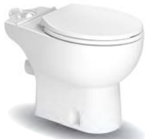
083/087 Toilet Bowl