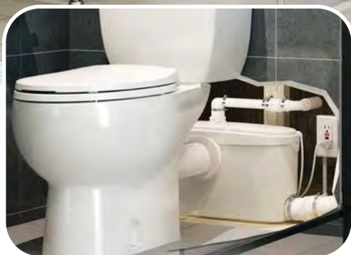
Conceal your pump behind the wall using our Extension Pipe (Page 8)