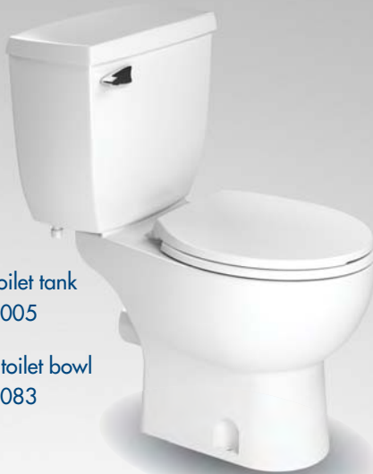
Insulated toilet tank Part# 005