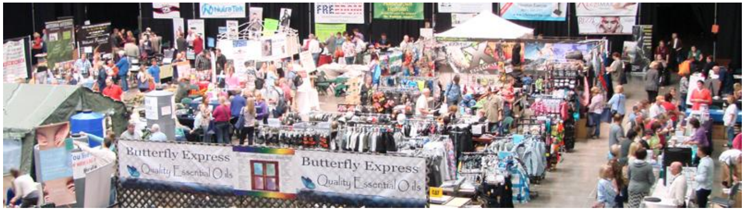
View of Previous Expo Main Vendor Area