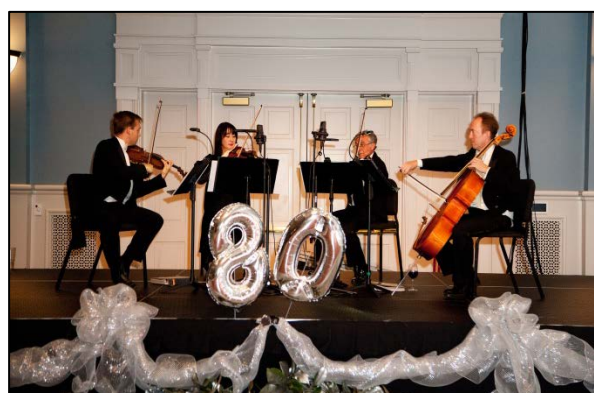
A few of the many highlight moments from A Night to Remember!