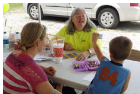
Community outreach event

However, one of the biggest drawbacks to training is, that it is just that ... training. After we leave it is all up to the congregations and their members to carry out their ministries in their respective places. There is little else we can do but equip and encourage. Unfortunately, while intentions are good and plans are made, when faced with the daunting task of getting beyond ourselves and carrying out these ministries, they often fall flat. As busy schedules fill up and routines set