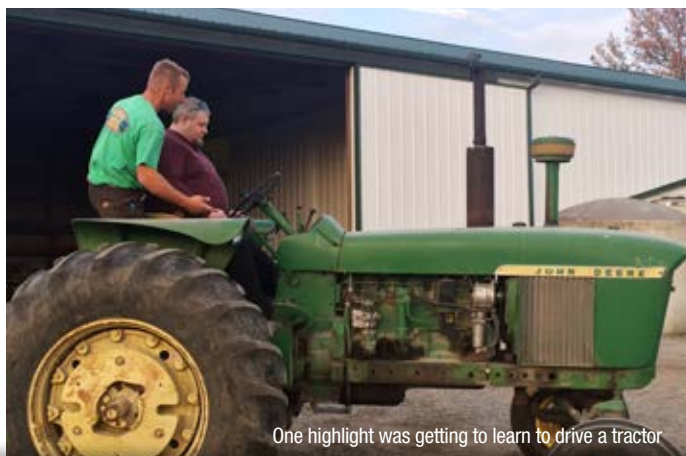
One highlight was getting to learn to drive a tractor