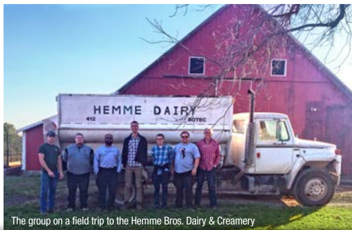
The group on a field trip to the Hemme Bros. Dairy & Creamery