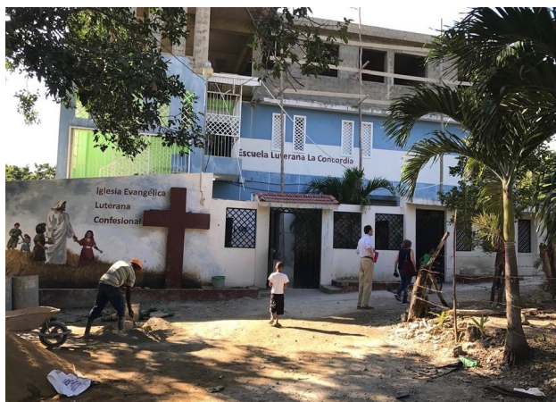
Left: New DR Seminary built on the top floor above Concordia Lutheran Church and School in Palmar Arriba