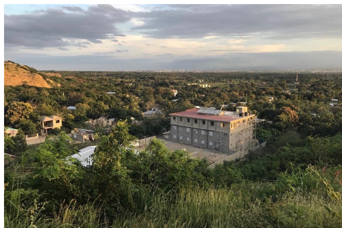
Right: View of the seminary from the top of the hill