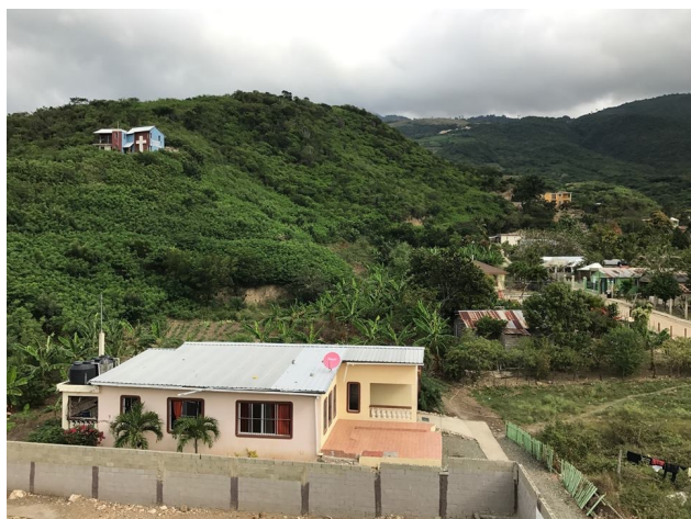
Left: View from the new Seminary, with Good Shepherd Lutheran Home in the foreground and Deaconess School at the top of the hill. In Palmar Arriba, Dominican Republic.