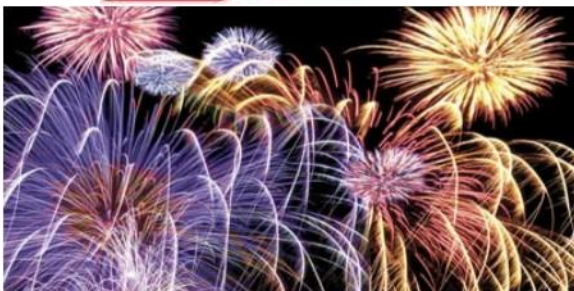
Aerial Arts Fireworks