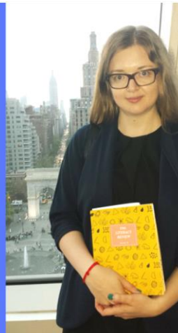
Social media posting to announce the Immigrant Stories platform