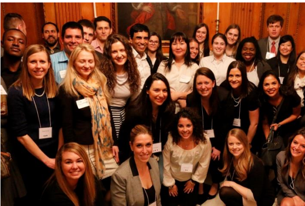
Professional Networking Event in March 2016

Social Media posting announcing the Immigrant Stories platform