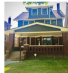
916 Herrick Dr Rehabilitation | $219,900

Check out hot new homes for sale in Glenville!