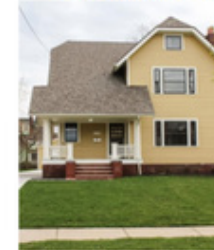
11116 Ashbury Ave Rehabilitation | $230,000