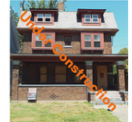
9629 Thorn Ave Rehabilitation | $199,990