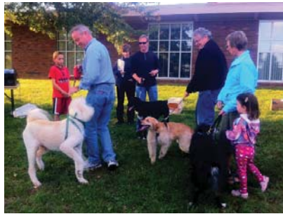
from our 9/26/2011 Blessing of the Animals