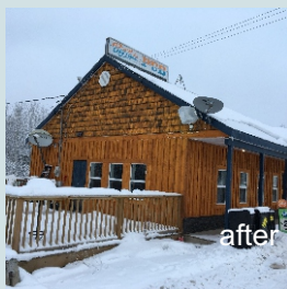
Big Lake Store & Pub