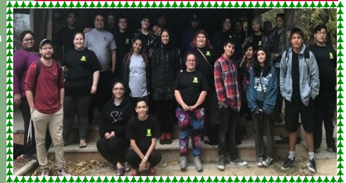
Participants of the 2017 Fall Retreat at Camp Arnes