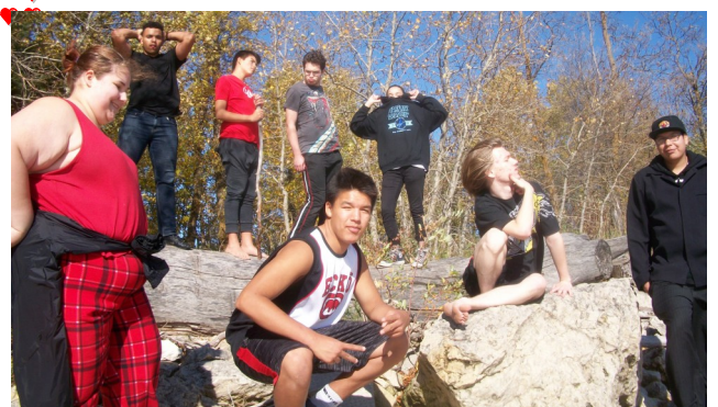
This year at Voices...