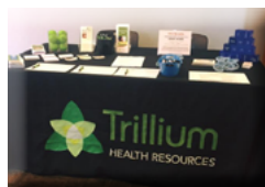
Nash Co. Info Session