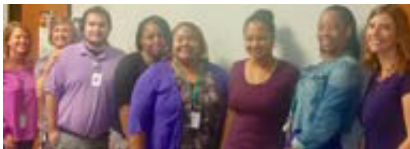
Pictured: Trillium's Call Center Staff

100% of the proceeds were donated to each team's charity of choice - Alzheimer's of NC , Restore One , American Cancer Society , and PGA Reach .