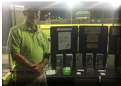
Lights of Hope Event - Greenville

Over the past quarter Trillium participated in community events and provided feedback at speaker forums throughout eastern North Carolina. Pictured below are just a few events Trillium attended. Select the image to learn more.