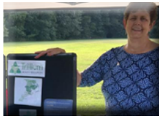
Pitt County Overdose Awareness Event