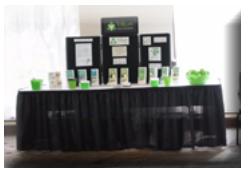
2017 Transforming Lives Awards-Greenville