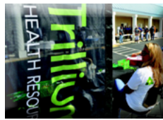
Making great strides for a Healthier Carteret Co.