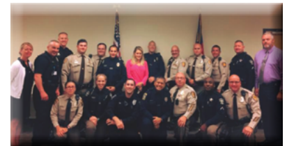
Pictured: Recent graduates - Law enforcement officers from New Hanover County

During the first quarter, Trillium's CIT program trained over 80 law enforcement officers and first responders across our catchment area.