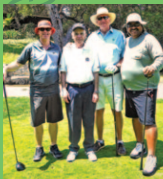
FIRST PLACE TEAM