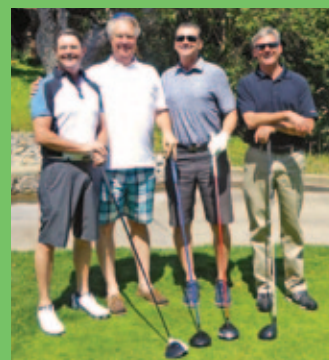
SECOND PLACE TEAM