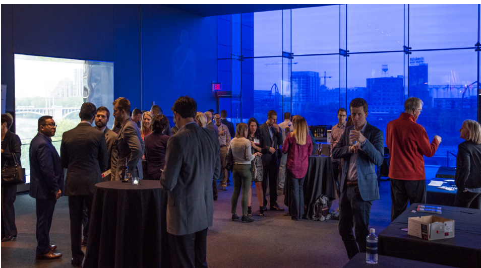
Networking after the Symposium