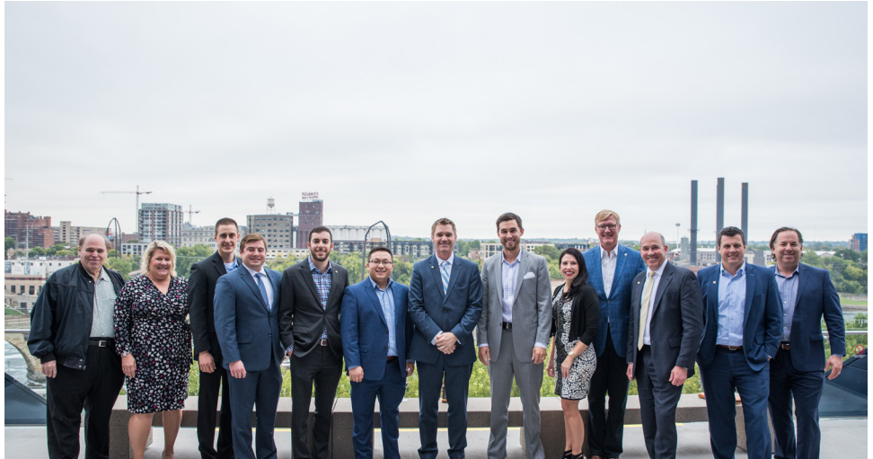
Past and Present Minnesota & Dakotas CCIM Chapter Boardmembers