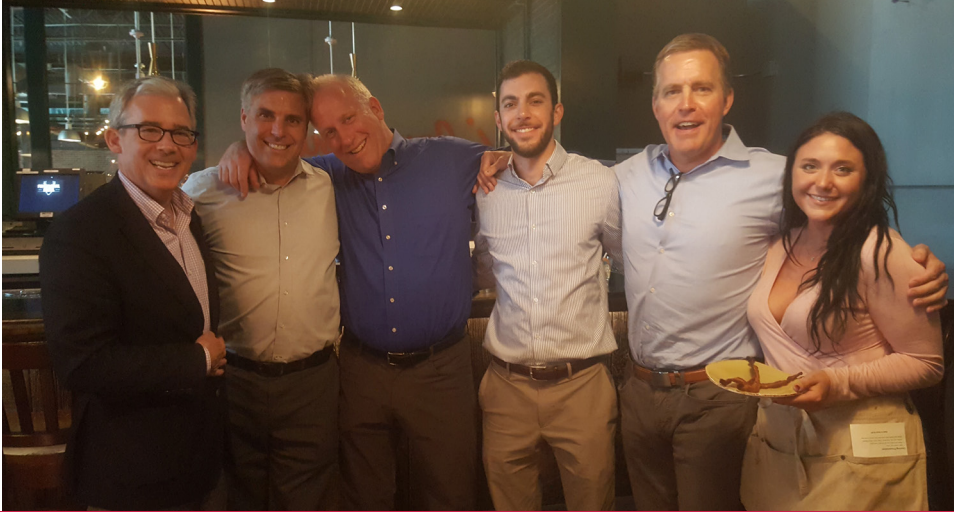
After the round table a group of us went over to the Punch Bowl Social for happy hour