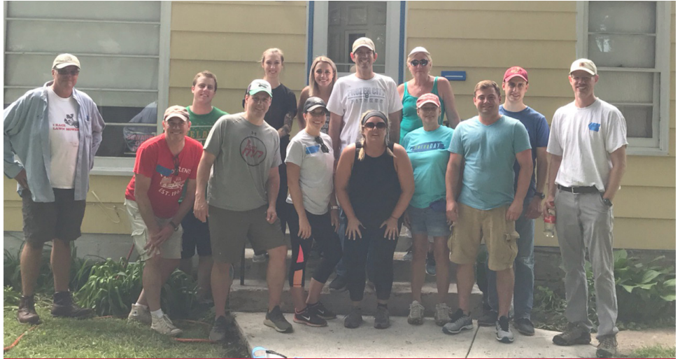
Big thanks to the CCIM volunteers who helped rebuild a home for a family in Minneapolis

The Minnesota-Dakotas CCIM Chapter partnered with Habitat for Humanity in June to help an existing homeowner in South Minneapolis to make home repairs and keep the family in their home. There was a group of 14 people who came together and volunteered their entire day to make this happen. Thank you volunteers!