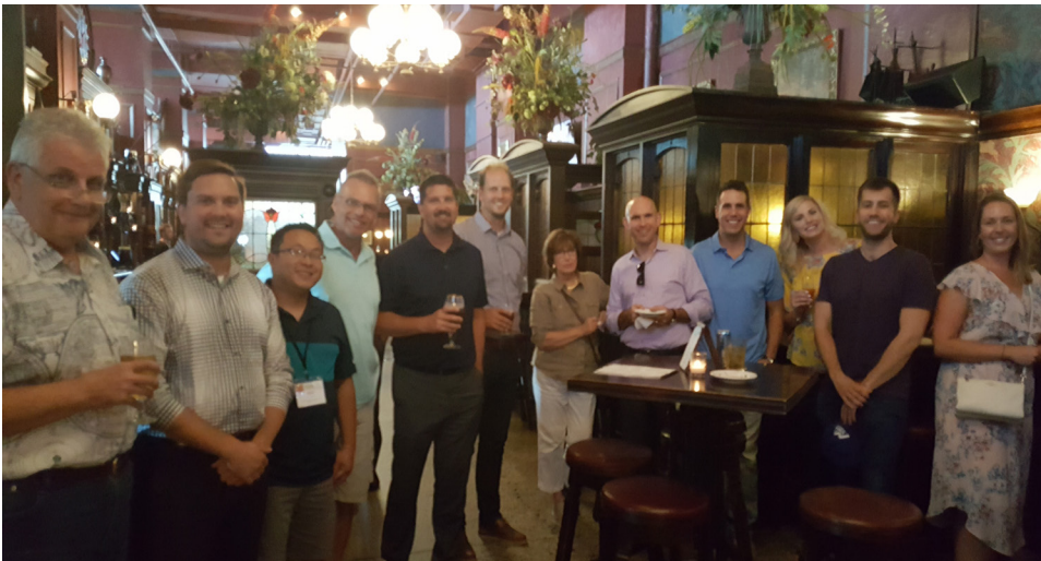
Some of the CI 104 student over at The Local for happy hour and social