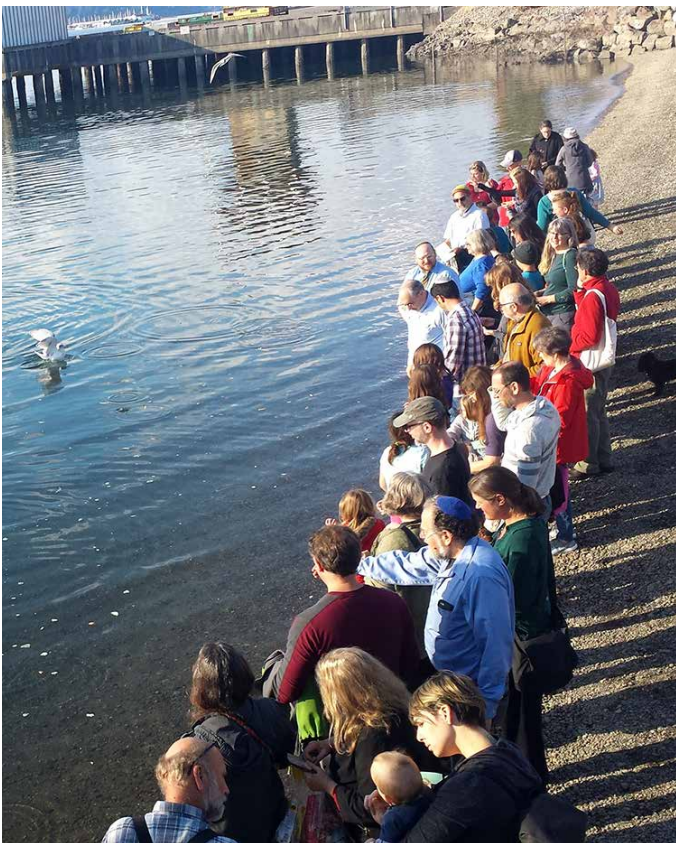
Tashlikh at Percival Landing