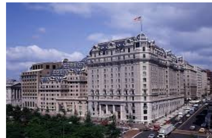
Located on Pennsylvania Avenue and just 2 blocks from the White House, this historic luxury hotel contains some of the finest meeting rooms, lodging accommodations and staff in DC.

Timely industry updates from FDA, USDA, and political experts are being planned. Mark your calendars for another informative meeting with lots of personal industry networking. Watch for registration materials in September.