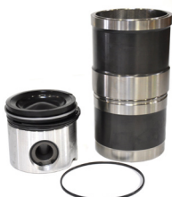
Cylinder Kit Part # RP1306

ISL and QSL CM850 (6TAA-9004) engines with high pressure common rail fuel system :