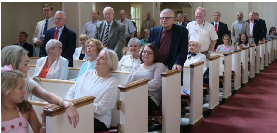
Recognition of fathers, 11 AM Service.