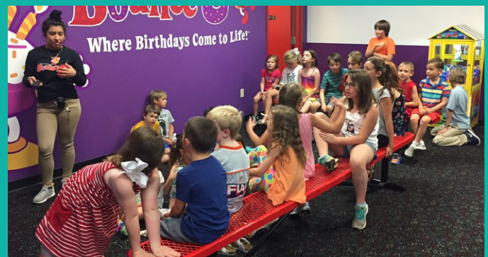
Gracenotes celebrated 2016-2017 with their end-of-year choir party at BounceU on Sunday, June 4

“I’ve commanded you to be brave and strong, haven’t I? Don’t be alarmed or terrified, because the Lord your God is with you wherever you go.” - Joshua 1:9