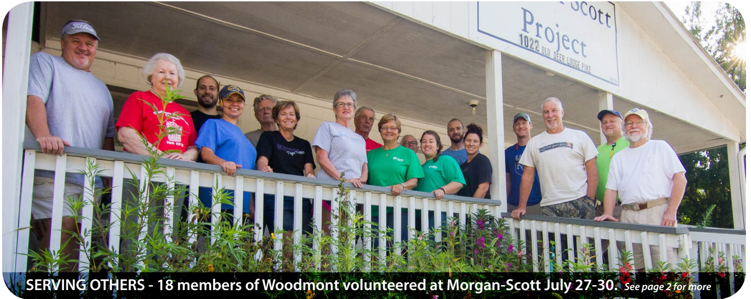
SERVING OTHERS - 18 members of Woodmont volunteered at Morgan-Scott July 27-30. See page 2 for more