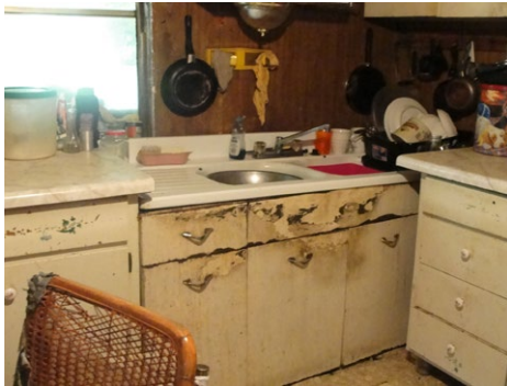
BEFORE: Lavada's kitchen

A big thank you to those Woodmont members who provided food for our journey.