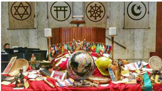
The altar at Church Center for the UN, owned by UMW