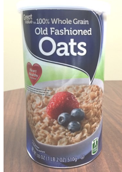
1 box oatmeal, 18 oz. or less