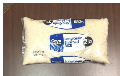
1 bag rice, 2 lbs.