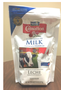
1 pkg. powdered milk, 10 oz. or less