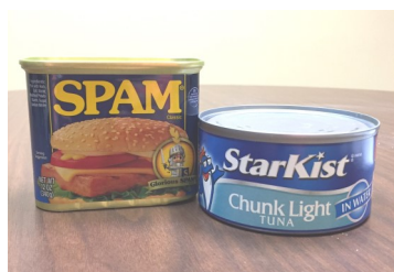
2 cans meat: ham, spam, or tuna only