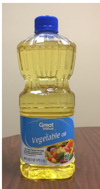
1 bottle cooking oil, 48 oz. or less

Kits should be delivered to the Morristown District office on Monday June 5 between 8:30 and 5:00 or Tuesday, June 6 between 8:30 and noon.