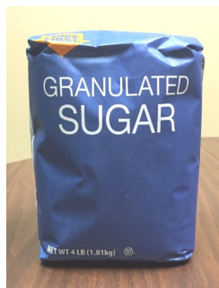
1 bag sugar, 4-5 lbs.