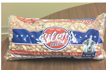
1 bag dried beans, 2 lbs.