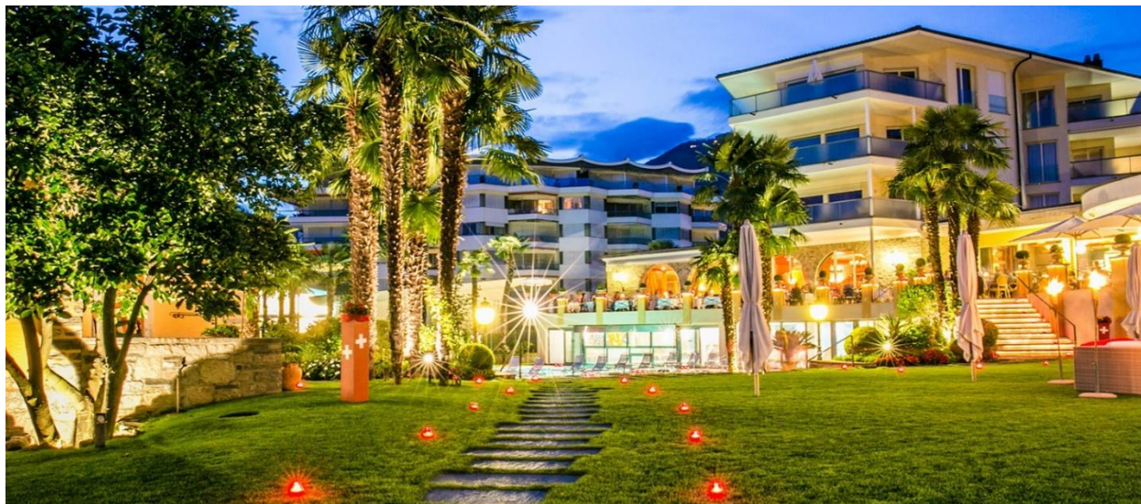
Overnight 5 Star Hotel Eden Rock

Once again, enjoy an opulent breakfast at the Hotel Weinegg . Please check out of your room and have your luggage ready to be loaded on to our luggage truck for transport to our next hotel. Today we'll drive over the Alps in Northern Italy and stop at Lake Como for a scenic lunch. We'll continue into Switzerland to the wonderful Eden Rock Hotel on Lake Maggiore on the Italian/ Swiss border. Once we arrive at Hotel Eden Rock , cocktails will be waiting as we check in to the hotel. Tonight, we'll enjoy a wonderful dinner overlooking lovely Lake Maggiore surrounded by mountains.