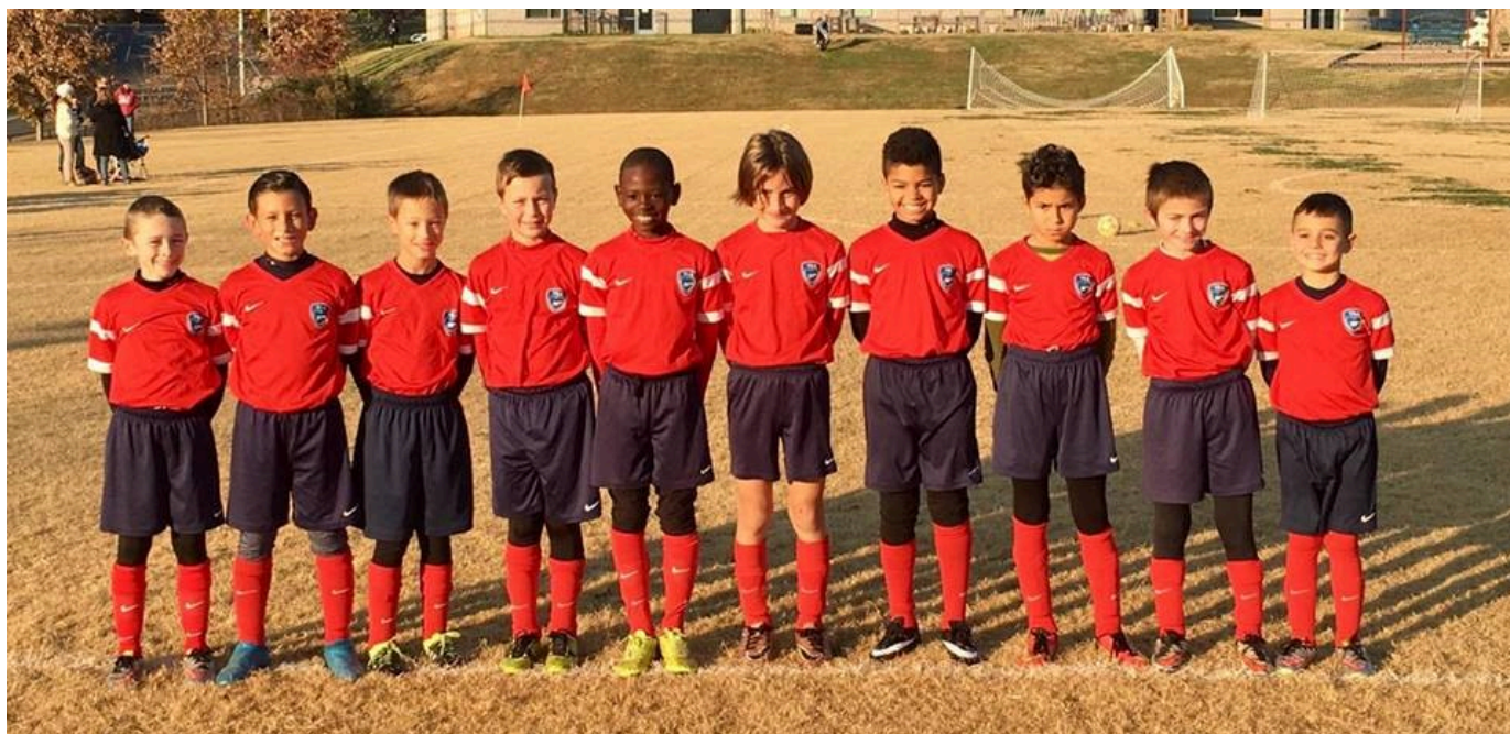
07 JR ACADEMY BOYS FACE THE CAMERA AT A LOCAL EVENT