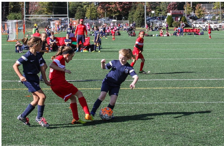
08 JR ACADEMY GIRLS IN ACTION

“We never want to take the focus away from our players, and we will continue to be diligent about that stance”