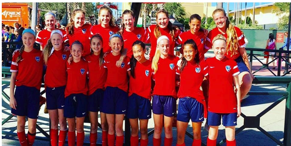
03 NPL PRE ACADEMY GIRLS RECENTLY AT DISNEY EVENT IN FLORIDA