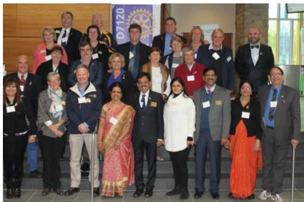
Pictured above is the 2016 Governor Elect attendees when they gathered for their Rotary Fellowship Brunch at Finger Lakes Community College in January 2016.