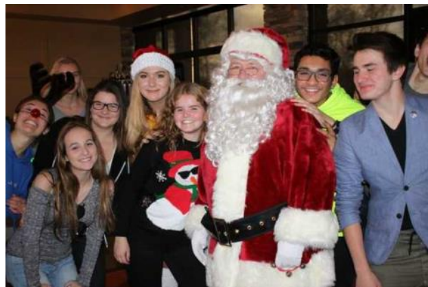
Santa and friends