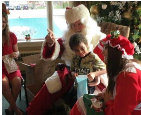
Santa listens to a child's wishes as Mrs. Claus hands over a gift bag.