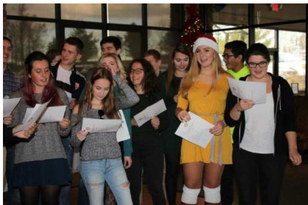
Youth Exchange students singing Christmas songs

The Victor-Farmington Rotary Club continued a long standing tradition dating back to 1981 when they hosted Rotary youth exchange students from throughout the Rochester/Finger Lakes region for a Christmas party at Ravenwood Golf Club on December 4 th . There were 21 foreign exchange students from Mexico, India, Sweden, Japan, Slovakia, Spain, the Netherlands, Finland, Belgium, Brazil, Hungary, Poland, Italy, Denmark, France, Germany and Chili. Joining them were 19 local students who will be leaving this summer for their year in a foreign country under the Rotary program.