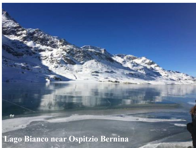
Lago Bianco near Ospitzio Bernina

I'm on my way back to Milan after a couple days away on a trip into the Swiss Alps. Attached is a photo of Lago Bianco near Ospitzio Bernina (seen below), a really incredible small lake at the base of a glacier. It was nice to get away after such a busy month!