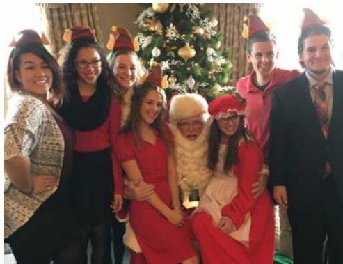
Odyssey Interact "elves" pose with Santa