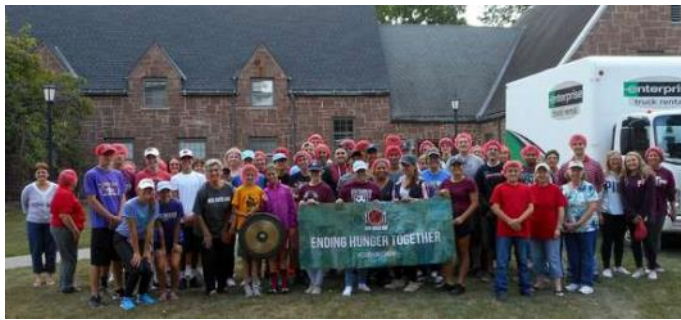
Pictured above - The Volunteers

When does a community like Newark have an opportunity to feed 34,000 of the world's hungriest children? The answer for us is every September when St. Mark's Episcopal Church hosts the Stop Hunger Now community meal challenge. This past weekend nearly 250 volunteers from the Newark area and beyond came together to package the soy, rice, dehydrated vegetables and nutrition packet which will be sent to one of the 73 participating countries with dire food needs.