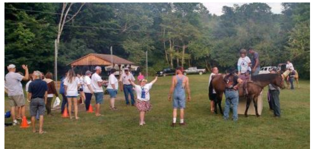
Above - Campers at the Genesee Valley Rotary Camp this past year.