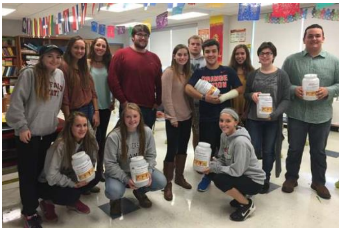
Seneca Falls Interact students collected Pennies for Polio on World Polio Day.