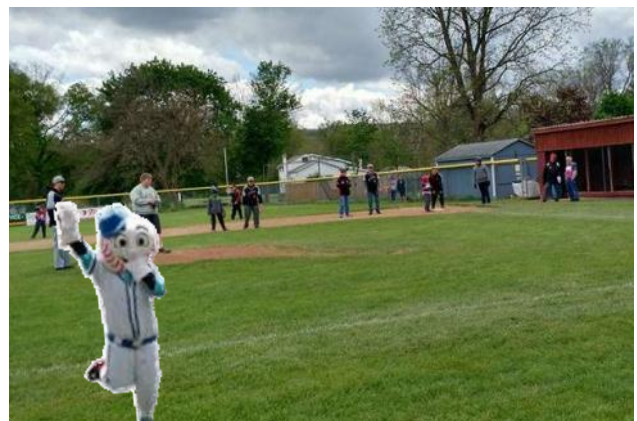
Pictured above are participants in the Rotary sponsored Sunshine Softball Game.