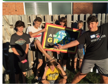
My team of guys in The Amazing Grace.

Today we celebrate Catechetical Sunday. This is when we honor the people in our parish who take risks; they step beyond what might be safe and familiar to "echo" our faith in our formal religious education programs. It's not always easy teaching a group of people of any age — be it 1st graders, 7th graders or adults. But as Christians, we follow a long line of holy people who knew they were chosen by Christ, and choose to risk themselves to show others his Amazing Grace.