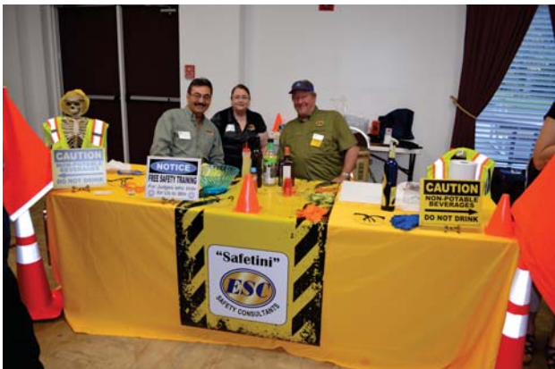
2nd Place - ESC Safety Consultants