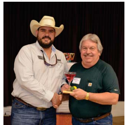
2nd Place - KCM Cabinets