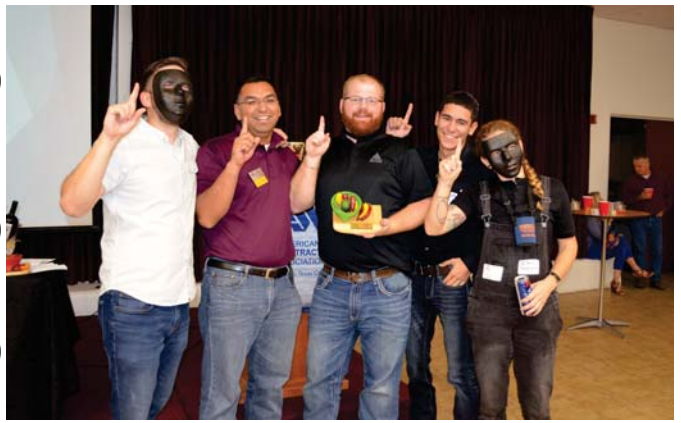
1st Place - Alpha Insulation & Waterproofing 2nd Place - Buyers Barricades (not pictured)