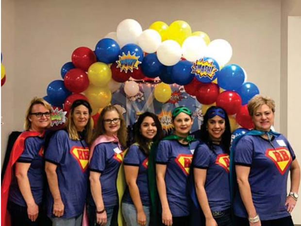
1st Place - Ridout Barrett & Co