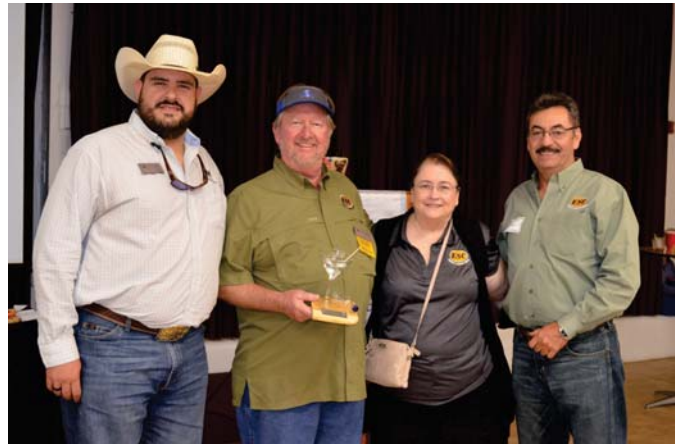
2nd Place - ESC Safety Consultants