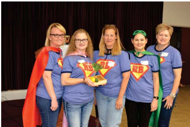
1st Place - Ridout Barrett & Co.