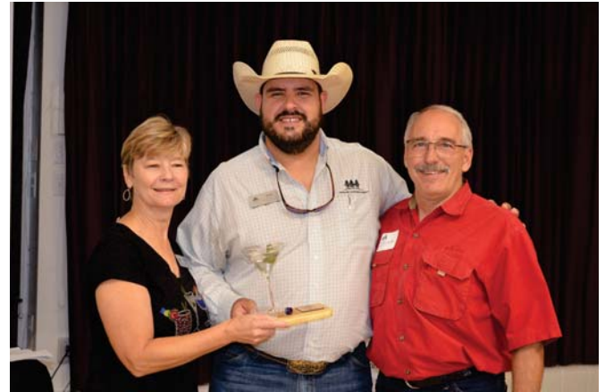
1st Place - Fire Alarm Control Systems