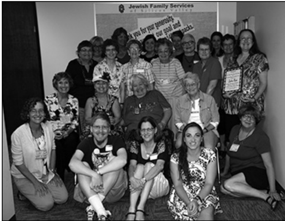
Happy Knitzvah members and friends

From its humble beginnings as a source of lap blankets for JFS seniors and families, Knitzvah has