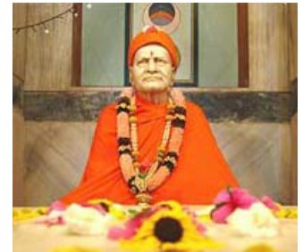
Yoga Niketan Ashram