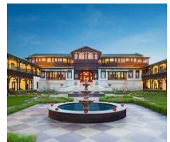
The Savoy WelcomHotel