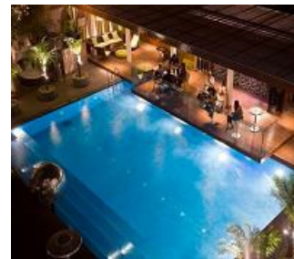
Park Hotel Pool