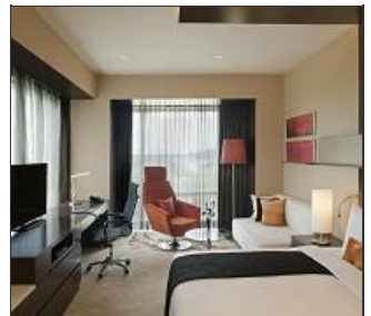
Radison Blu Amritsar (4*) (B) (Superior)

Accommodation: Radison Blu Amritsar (4*) (B) (Superior)