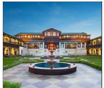
The Savoy WelcomHotel

Your English speaking escort will accompany the group with questions and logistics throughout your day.