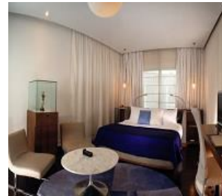
Park Hotel Deluxe Room

The Park, New Delhi, highly rated among the luxury five star hotels in Delhi is situated in the heart of the city centre's business and entertainment hub - Connaught Place. The Park, our luxury five star hotel in New Delhi redefines avant-garde hospitality. Stylish spaces coupled with discreet luxury and impeccable service renders this New Delhi hotel a unique flavor. Lined with handpicked contemporary art throughout the public and private spaces, this Delhi hotel provides an elevated standard of style, design and decor.