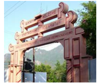
Yoga Niketan Ashram

Ashram has a community Kitchen where food is prepared free from all type of spices and chilles. Different variety of breakfast are prepared mainly of porridge and tea. In food, Indian Chappati (bread), Rice, One type of pulse one type of green vegetable and green salad is served. Every student is provided with proper dishes which they have to clean themselves, during their stay in the ashram. At times seasonal fruit is also served.