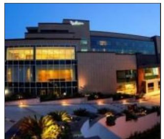
Radisson Blu Agra (4*) (B) (Deluxe Taj Facing Room)

Accommodation: Radisson Blu Agra (4*) (B) (Deluxe Taj Facing Room)