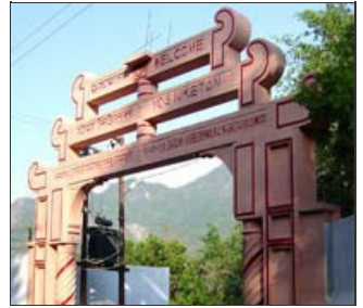
Yoga Niketan Ashram (3*)

Your English speaking escort will accompany the group with questions and logistics throughout your day.