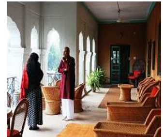
Judges Court Hotel