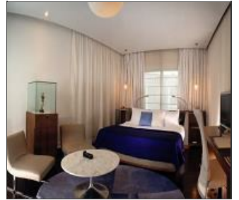
Park Hotel Deluxe Room