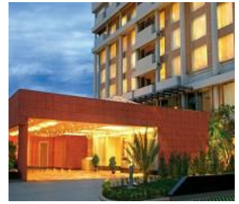
Taj Vivanta Chandigarh

Taj Chandigarh, one of the best 5-star hotels in Chandigarh, celebrates the dynamic spirit of the city in its sophisticated architecture and interiors. Built only recently, the hotel is located in Sector 17, the city's prime business and shopping area.