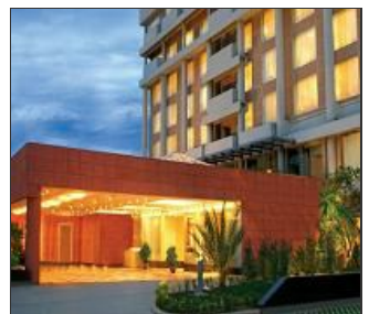
Taj Vivanta Chandigarh