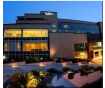
The Radisson Blu Agra

Your English speaking escort will accompany the group with questions and logistics throughout your day.