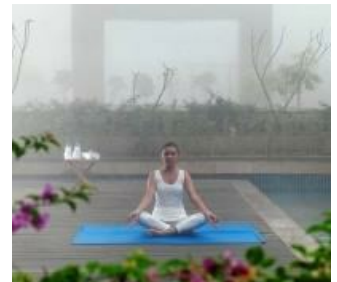
Health Club & Spa