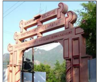
Yoga Niketan Ashram

Your English speaking escort will accompany the group with questions and logistics throughout your day.