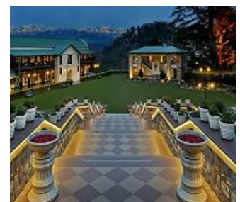
The Savoy View