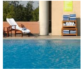
Taj Swimming Pool