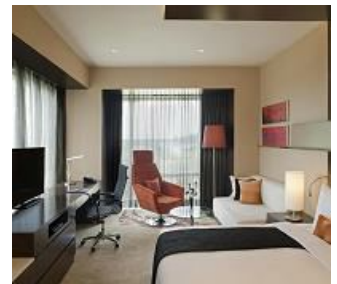
Radisson Blu Superior Room

Conveniently located near the Golden Temple, the Radisson Blu Hotel Amritsar is the ideal home base for your trip to Amritsar. Surrounded by expansive verdant lawns and meticulous landscaping, making you feel as though you are in an oasis.